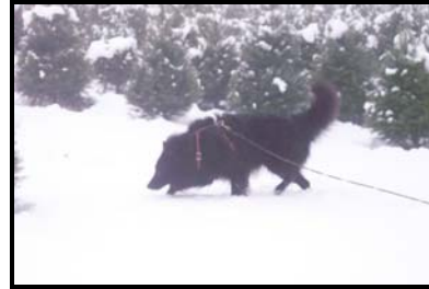
Trackin' in the Snow (to the tune of Singin' in the Rain)

I recently took advantage of the rare snowfall to do some tracking on the neighboring tree farm. While working my dogs I started singing this song. With apologies to the great Gene Kelly!