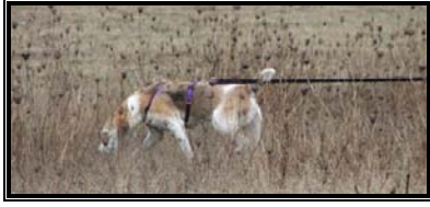
Multi HIT U-CD Am/Can/Int CH Kingsbury's True Grit, CGC, CD, NA, NAJ

Merry was our first Harrier and came to us when she was 9 weeks old. Despite her strong independent streak, she has delighted us ever since. Merry earned her Championship pretty easily, despite her novice handler (me) and went on to earn some group placements as a special. Although we tried, Merry did not seem too interested in performance events until she got older. Around 5 or so, she started showing a lot more interest, so we got to work. She earned her CD with two HIT's at the Cascade Hound show and went on to get HIT at the Harrier National. Although we trained for Open, Merry was 10 before we were truly ready to compete and she developed a stay problem. We worked on it for about a year, but never really saw any improvement, so I retired her from the obedience ring. Now, at 11.5 years of age, Merry is going strong. This past fall, she earned a Veteran's Group 3 and a Group 4 at the Cascade Hound Show and was the oldest dog competing. Most people who look at her can't believe she is as old as she is. This fall, we returned to tracking and Merry's been having a ball and tearing up the tracks. We hope to get her TD in the spring. Affectionately known as the "silly old Goat", we hope Merry will be going strong for years to come.