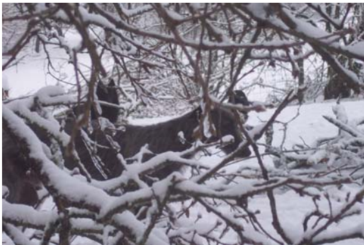
Find the dogs!