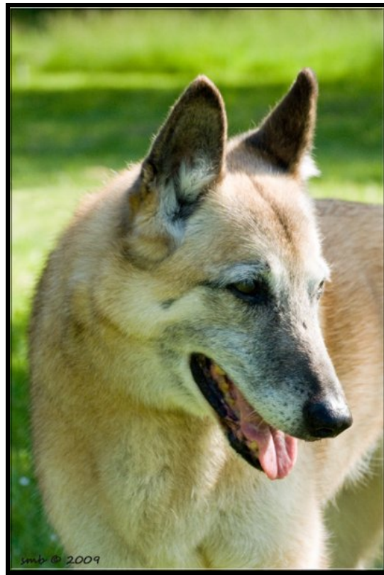
U-CDX CH Trew Bleue Anticipation CDX RA HCTs ROM2, 2X ABMC AOM RIP 3-22-1993 to 7-21-2009

Section 13d Test Worker Option. A club may set aside tracks for test workers from previous tests, as defined and identified by the test giving club. This information and the number of tracks to be set aside must be published in the premium list. ( There is a table defining the limits. )