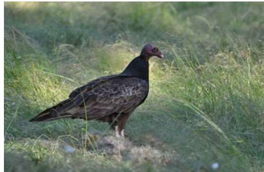
Leader of HSUS Pit Bull rehabilitation team.