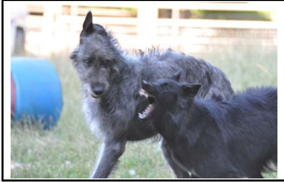
“You talkin’ to me?”

Why yes, I am! This newsletter will only continue with your assistance. This means sending in photos, stories, bitches, brags, comments and complaints.