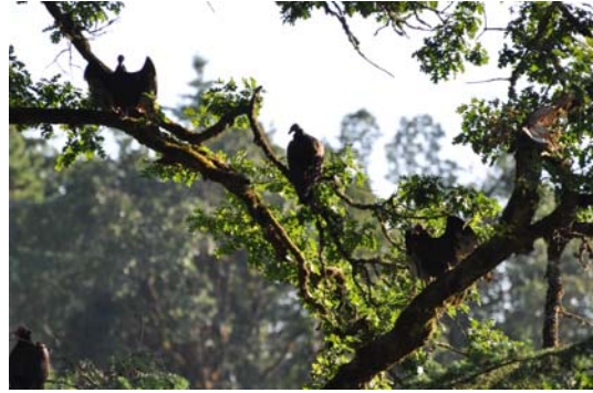
Exclusive Photo! PeTA’s Purebred dog rescue team.